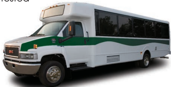
Several lengths of General Motors chassis also available.